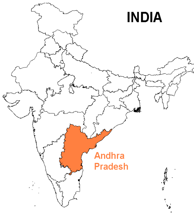
Fig. 1a: Andhra Pradesh (AP)